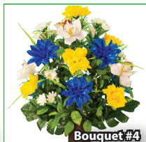
Blue and Yellow Orchid Mix