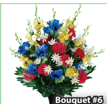
Blue Anemone Garden Mix Bouquet