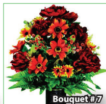
Orange Lily and Burgundy Dahlia