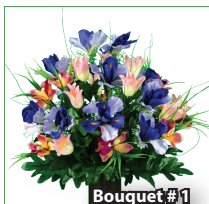
Cream and Pink Tulips w/Purple Iris