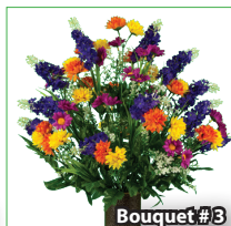
Purple Violet Yellow Wildflower Mix