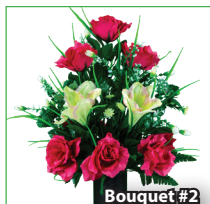
Fuchsia Roses and Amaryllis