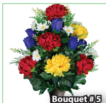
Purple Roses with Red and Yellow Mums